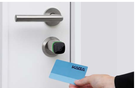
Kaba digital cylinder