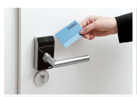
Kaba c-lever compact